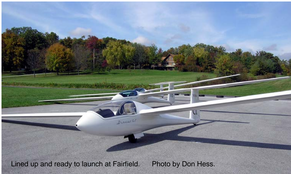
Lined up and ready to launch at Fairfield.